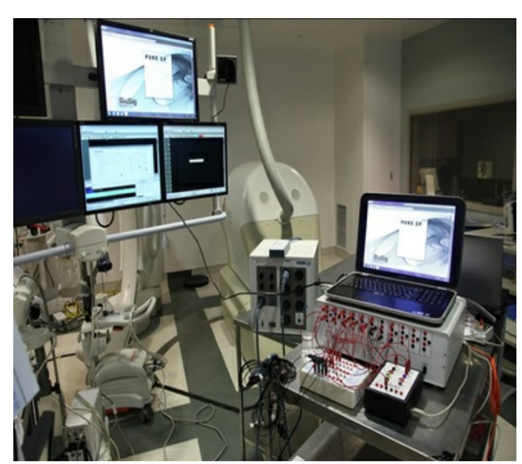
Proof of Concept Testing at UCLA's EP Lab

Subsequently, in the third quarter of 2013, we analyzed the results of our proof of concept unit to determine the final design of the PURE EP System prototype. Because the proof of concept unit was designed to verify the capabilities of the main components of the PURE EP System, we established a list of tasks necessary to complete the prototype (which we intend to use for end-user preference studies, additional pre-clinical studies and research studies), which has since been completed.