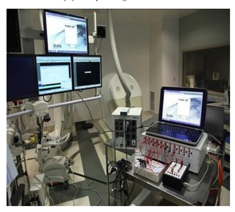
The current PURE EP System prototype