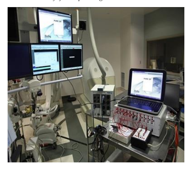
The current PURE EP System prototype