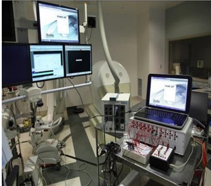
The current PURE EP System prototype