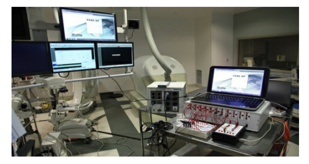
The current PURE EP System prototype