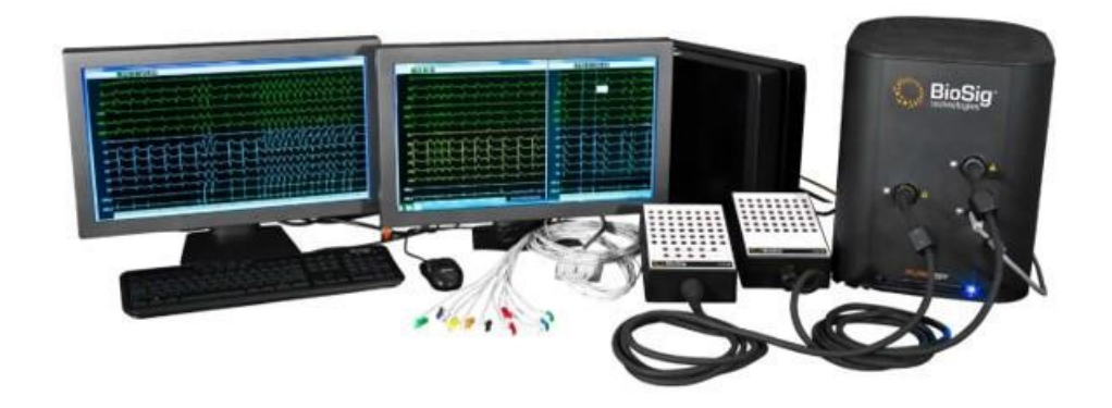
Examples of PURE EP Signals